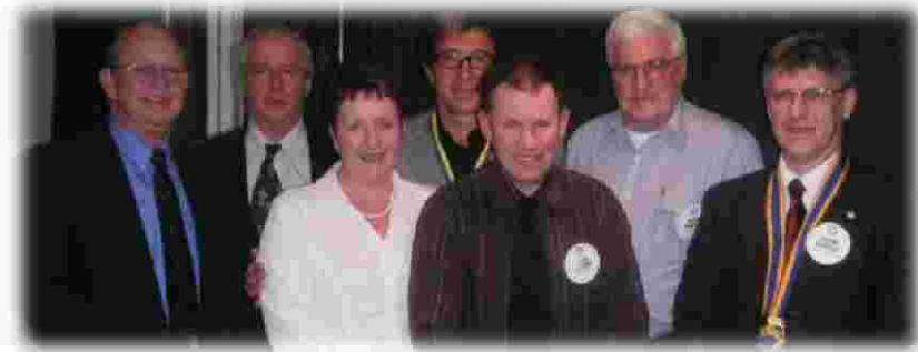
The 09-2010 Board of Directors