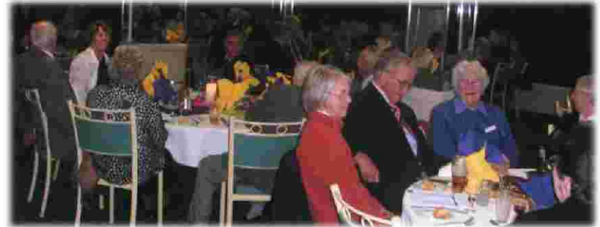
Excellent night, attendance, venue, atmosphere and food.