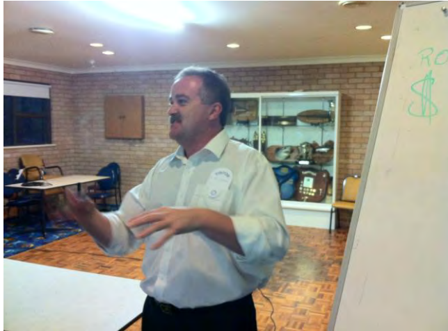
Owner CEO Bakers Delight Ulladulla