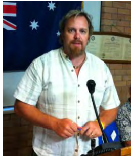
Nursing Unit Manager Milton Hospital