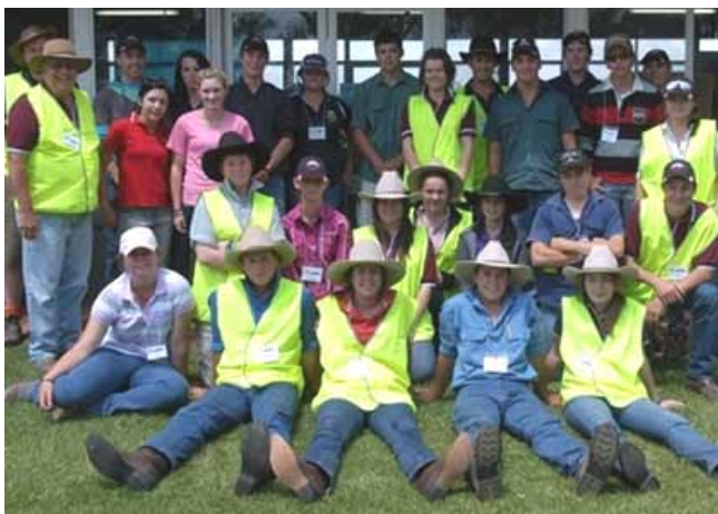
Camp participants came from all over the Central West.

Arrangements were made to visit local cropping farms farmers provided information on their cereal and seed crops. They also explained their weed control program, machinery and anything else relevant to cropping.