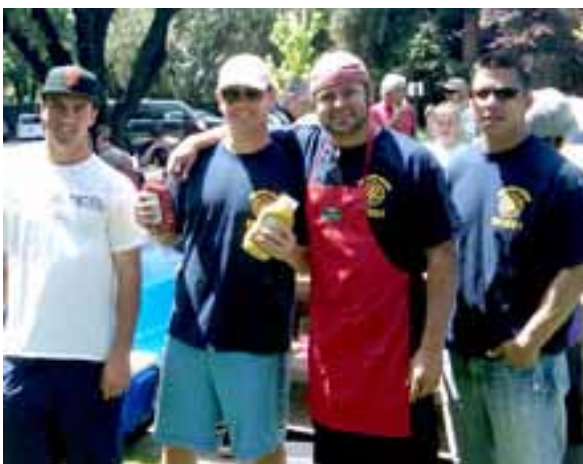
Members of the Diablo View Rotary Club donate their time by cleaning up the Iron Horse Trail in California.

She says the club carries out many projects in the community so that members have an opportunity to do hands-on service. Every month, for instance, it plans an outdoor project, such as cleaning up nature trails. Younger Rotarians usually have more time than cash at their disposal, she says, so they tend to contribute by volunteering.