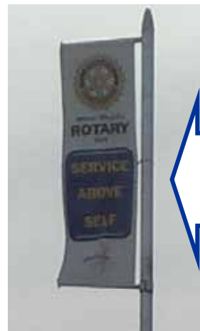
Service Above Self

New banners on the highway's flagpoles, advertising Rotary, look great.