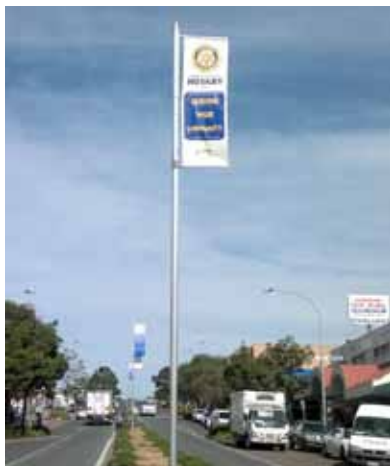
Serving Your Community