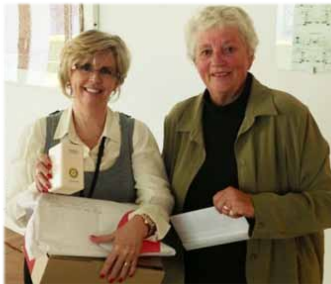
The PM's private secretary with Joanna Gash and the MoneyBoxes