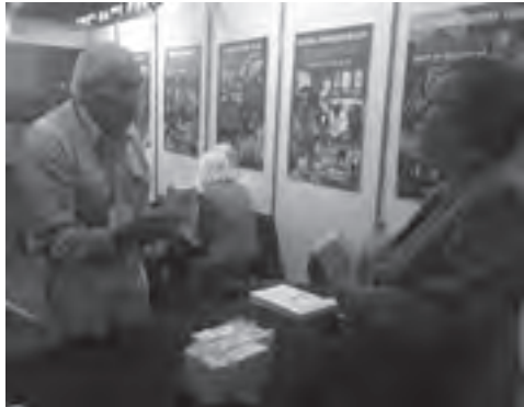
Club's Moneyboxes at the Rotary International Convention in Sydney, 1-4 June 2014.