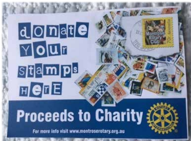
Sign advertising the project

"We get best prices by trimming the waste paper and sorting the stamps into local, foreign, $1.00 and under $1. We have no idea who the dealers sell them to, or why anyone would want them. We just get paid and help good causes," she says. Her dealers will also buy neglected stamp albums – Olympic swimmer Susie O'Neill donated all her childhood albums.