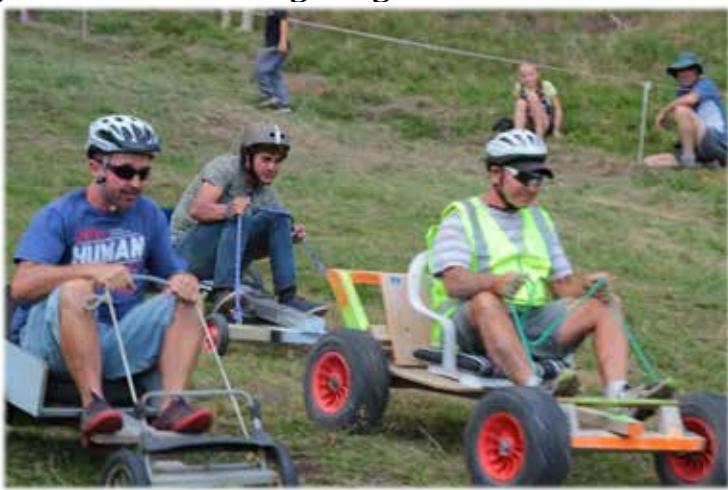
The adults show a great deal of concentration as they race down the hillside, neck and neck

The Menz Shed held two Saturday morning trolley-building workshops for those who didn't already have a trolley of their own. These were a great opportunity to share and learn skills, and were well attended by enthusiastic children.