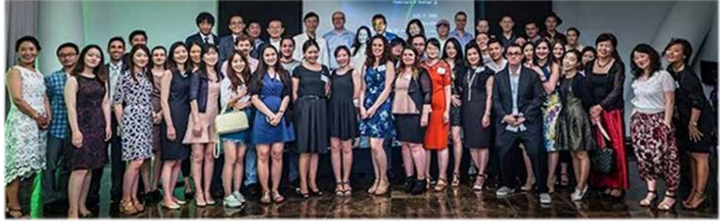
Members of the Seoul Young Leaders Satellite Club in Seoul, Korea.

our challenges were: diminishing membership; inability to attract younger people; lack of community service; and uninteresting meetings sinking motivation and enthusiasm.