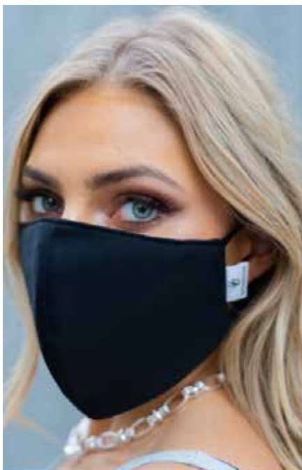
*Reusable Mask – Victorian State Government Approved - July 2020